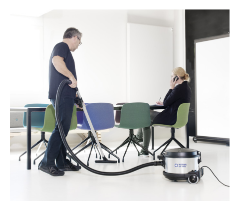
The GD 930 is the perfect choice for demanding applications such as offices, hotels and public buildings