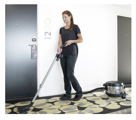
The new GD 930Q is specially built for noise sensitive areas with a low comforting background sound pressure level of only 42 dB(A)