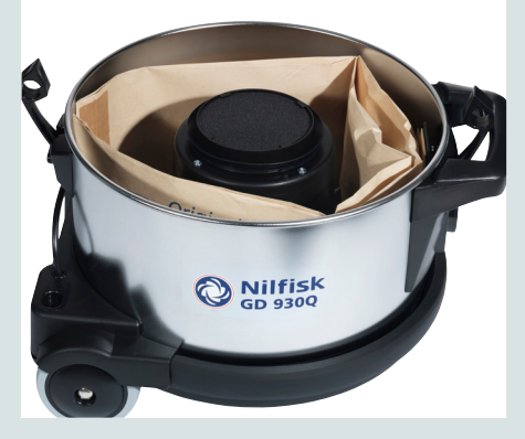
Durable steel container and 15 litre dust bag